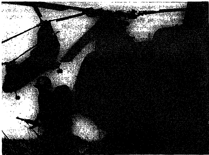
Vertol Division The Boeing Company

The poison now at issue is milk. In Europeans, intolerance to lactose, or milk sugar, occurs as a rare recessive trait. Healthy parents, each carrying a single mutant gene, have children approximately one-fourth of whom react to milk ingestion with diarrhea, vomiting, malabsorption, and even death. When reports on milk intolerance in various groups of non-European began to accumulate, it was remembered that malnourished children in east Africa got diarrhea when