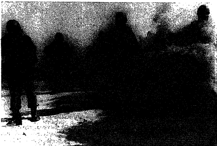
Army News Features

mediate result is a persistent muscular contraction, a state of cramp, followed by paralysis. And this is exactly what happens when the critical esterase, called acetylcholinesterase, becomes inhibited by a G-type phosphorous compound. When the block