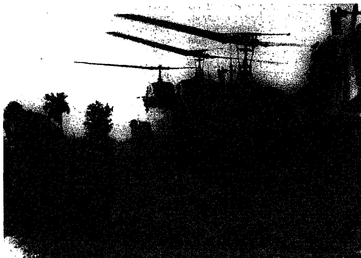
Army News Features